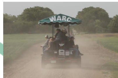
Trailer ride out to the plots at the 2023 Scott Field Day.

This year WARC was asked to co-host the SaskWheat Coffee Talk in Wilkie alongside Nutrien and Syngenta. Although the event landed during the coldest week of the year, we were fortunate for a strong turnout and a great event.