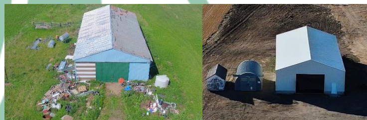
Storage shed on new WARC acreage before clean up and restoration (L) and after (R).

At the turn of 2023, WARC also decided to purchase an acreage located in the Town of Scott for increased storage capacity and convenient access to our new WARC land. Throughout the summer we had the 10-acre parcel cleaned up and the buildings restored for equipment storage. As we continue expansion in 2024, we will be erecting a multi-purpose agricultural facility commencing at ground thaw.