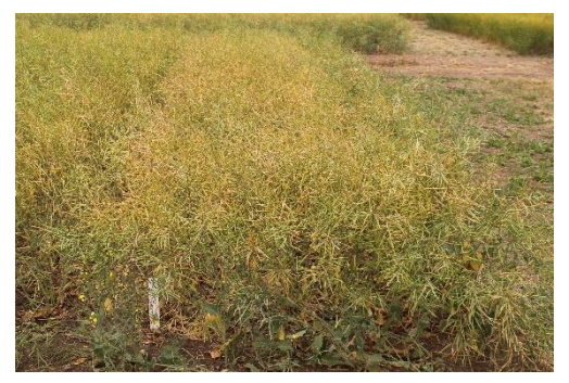
Seeded at 161 seeds/m<sup>2</sup>

Photos below show the treatment effects of faba bean grown after application of Quinclorac 12 months prior. Photos taken on August 15, 2018.