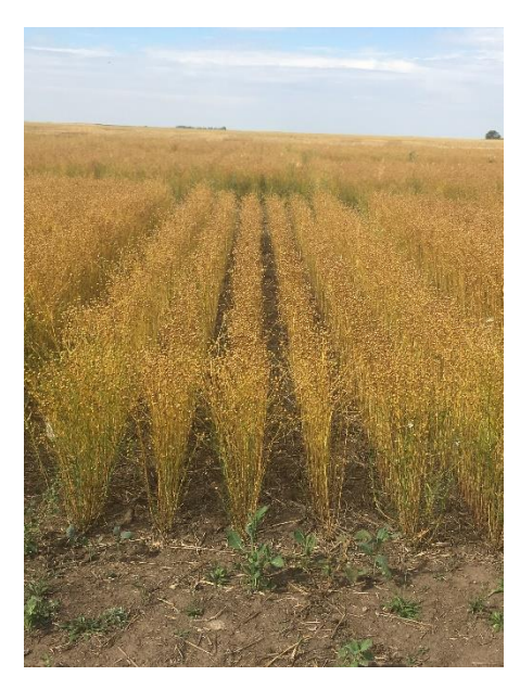
20 kg P<sub>2</sub>O<sub>5</sub>/ha

The photos below show the difference in flax yield resulting from application of phosphorus and nitrogen fertilizer at varying rates.