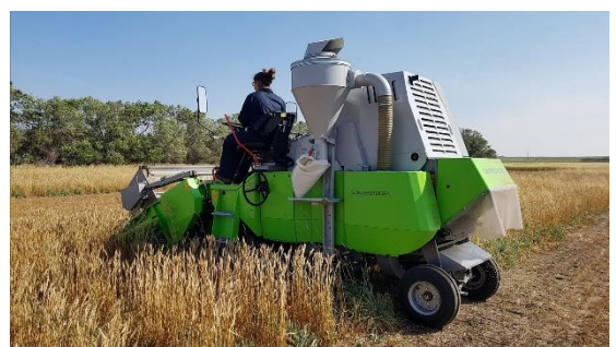
Kayla is enjoying harvesting some wheat in our Accelerated Cropping Systems trial.

herbicide efficacy in quinoa, critical period of weed control in faba beans, seeding rates in canola, enhancing wheat profitability through intensive wheat management, and flax yield response to P and N. Seeding wrapped up in early June and then we began the spraying season. This included many early mornings and late nights in order to spray during favourable wind conditions. But, with everyone's help we managed to complete all the spraying on time! Other tasks completed this summer included disease and maturity ratings, plant heights, plant counts, bio-massing, pod counts, and weeding!