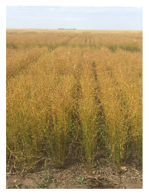
150 kg N/ha and 20 kg P_2O_5/ha