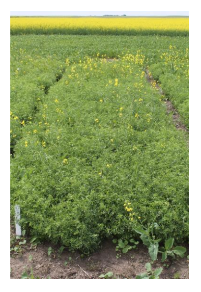
Treatment 7 – Fall Edge and Fall Metribuzin