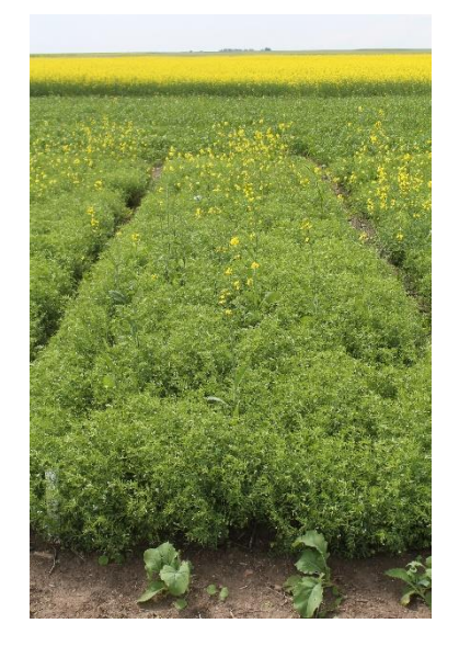
Treatment 13 – Fall Pyroxasulfone and Spring Metribuzin