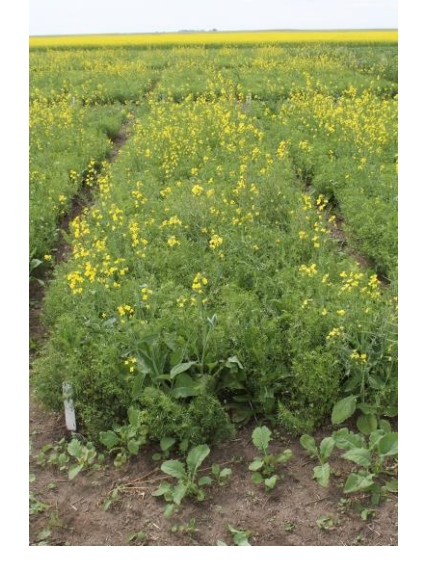
Treatment 11 – Fall Pyroxasulfone