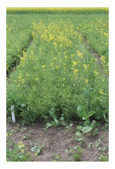
Treatment 6 – Fall Edge