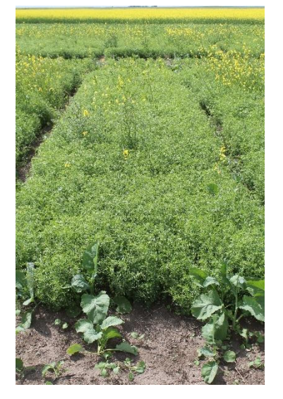
Treatment 3 – Spring Metribuzin