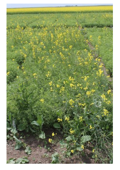
Treatment 1 – Untreated Check