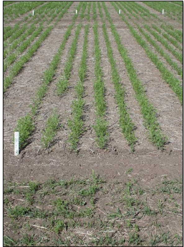
Fall Fierce; Spring Glyphosate & Goldwing